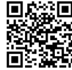
SC344m - EN